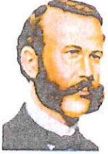
Jean Henry Dunant Founder of Red Cross 1828-1910